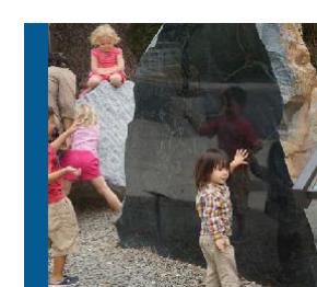
California Rock Garden