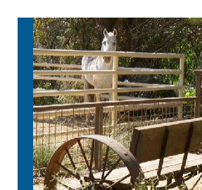
Animal Science GATEway