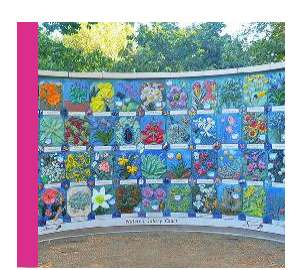
Nature's Gallery Court