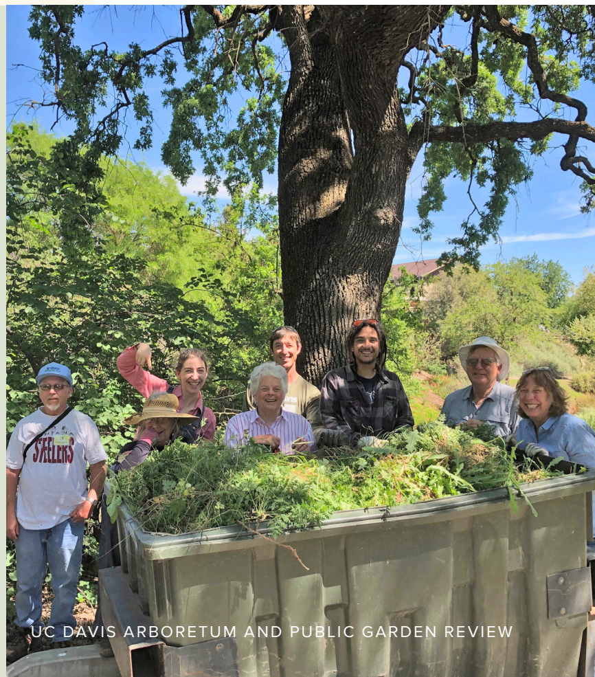
UC DAVIS ARBORETUM AND PUBLIC GARDEN REVIEW

Thanks to these volunteers, we have limited the exponential growth of weeds in our gardens—an incredible accomplishment that will have a lasting impact. Look out for more Bonus Weeding Parties as the seasons change!